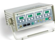
EnligHTN RF Ablation Generator