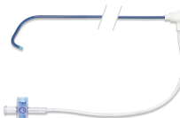
EnligHTN Guiding Catheter